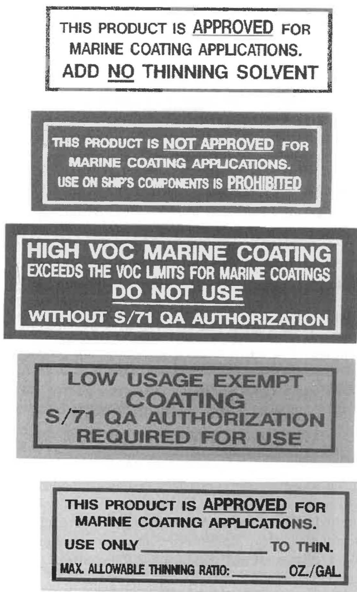
Figure 2. – Labels used on all coatings received by PSNS as per their compliance plan.

This section includes the four steam testing boilers and two associated super heaters located in Building 431, Source ID# 41-431-181-1 through 41-431-181-6. Construction of these two stationary emission units commenced prior to June 9, 1989. The applicability of 40 CFR 60, Subpart Dc, covers boilers for which construction commenced after June 9, 1989. Portable boiler 03-PORT-184 is also included in this section, and has a maximum design input capacity of less than 10 million BTUs per hour. The applicability of 40 CFR 60, Subpart Dc, covers boilers with an input capacity of between 10 and 100 million BTU/hr. Therefore, these boilers are not subject to the Standards of Performance for New Stationary Sources (NSPS) of 40 CFR Part 60.