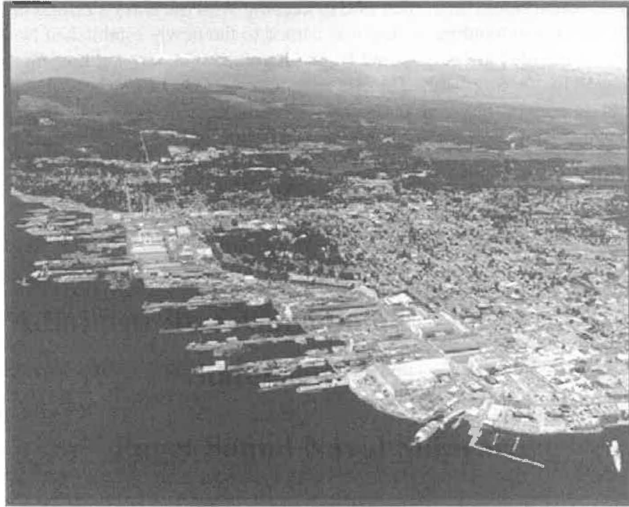
Aerial view: Puget Sound Naval Shipyard and Naval Station Bremerton (NSB). Together these are the Bremerton Naval Commands, or BNC.